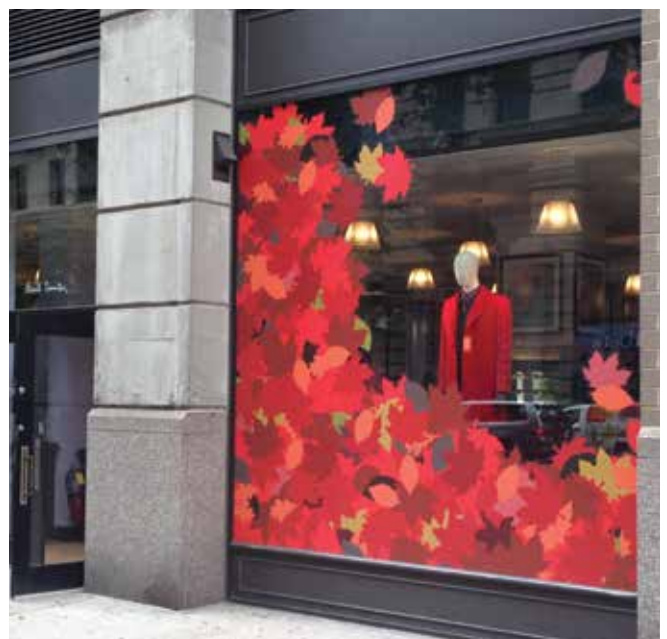
▲ A retailer promotes the seasonal change via their window display.

Create your own retail calendar and select events relevant to your business, and merchandise your product ranges accordingly.